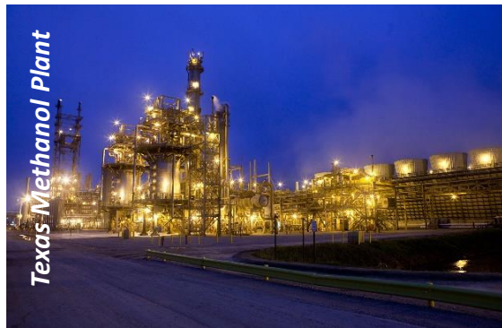
Texas Methanol Plant

With methanol ideally positioned to capitalise on the H2 economy as a H2 liquid carrier