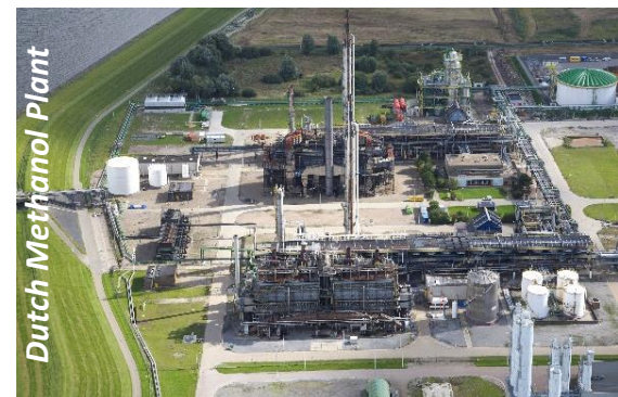
Dutch Methanol Plant