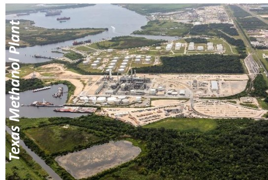
Texas Methanol Plant